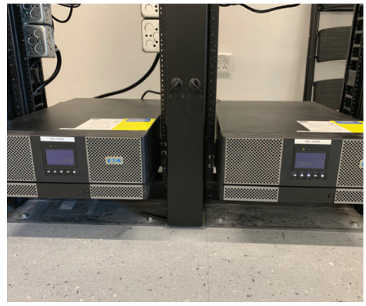
Two Eaton 9PX UPSs protecting Stewart's servers and other critical devices.